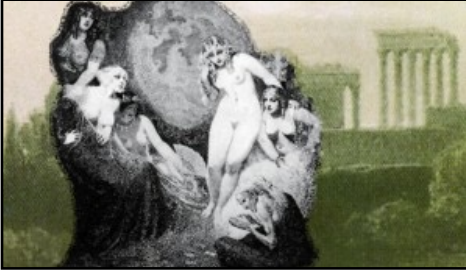
Temple Prostitution in Baal Worship

Satan Seeks to Pervert the Marriage Institution—It was Satan's studied effort [in the antediluvian age] to pervert the marriage institution, to weaken its obligations and lessen its sacredness; for in no surer way could he deface the image of God in man and open the door to misery and vice. [1]Patriarchs and Prophets, 338. – {AH 326.1}